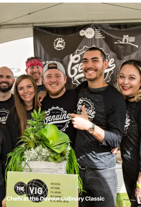
Chefs at the Devour Culinary Classic