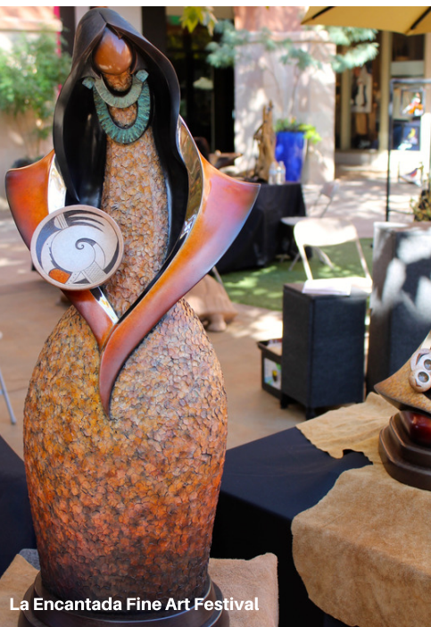
La Encantada Fine Art Festival

SAACA Creative Placemaking programs helped leverage the power of arts, culture and community to drive a broader agenda for change, growth and transformation in a way that also builds character and quality of place. Through cross-sector collaborative partnerships, we invested over $300,000 in unique arts and cultural programs, which helped to shape the social, physical, cultural and economic identity of our communities. The programs, events and temporary arts installations spurred economic development, and created stronger social cohesion.