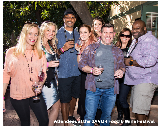
Attendees at the SAVOR Food & Wine Festival