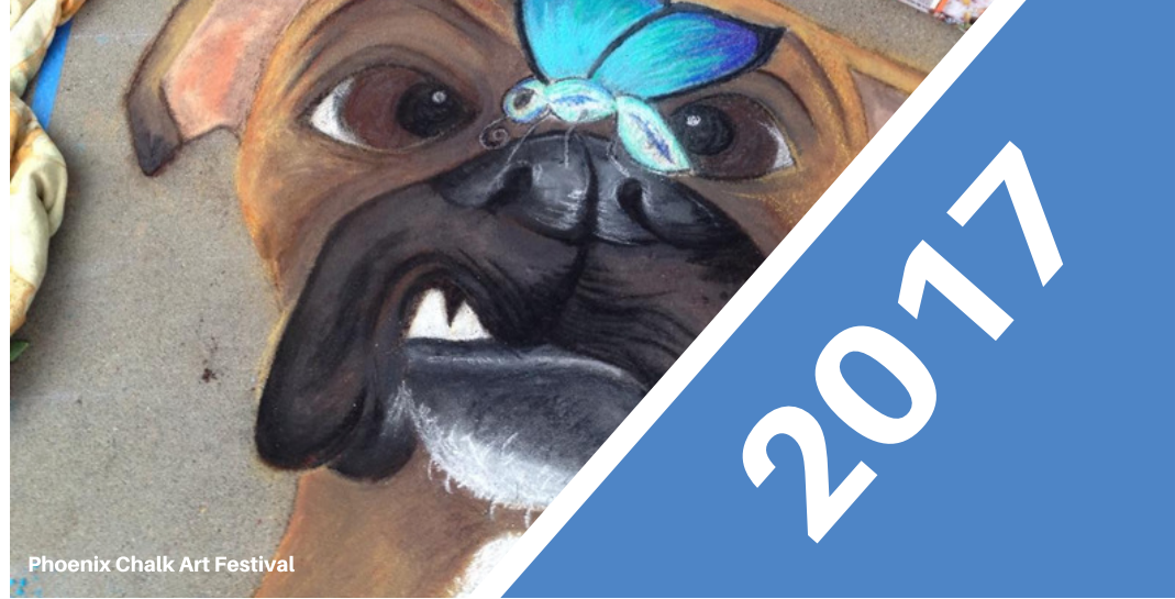
Phoenix Chalk Art Festival