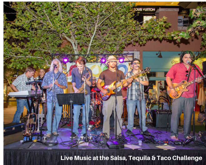
Live Music at the Salsa, Tequila & Taco Challenge