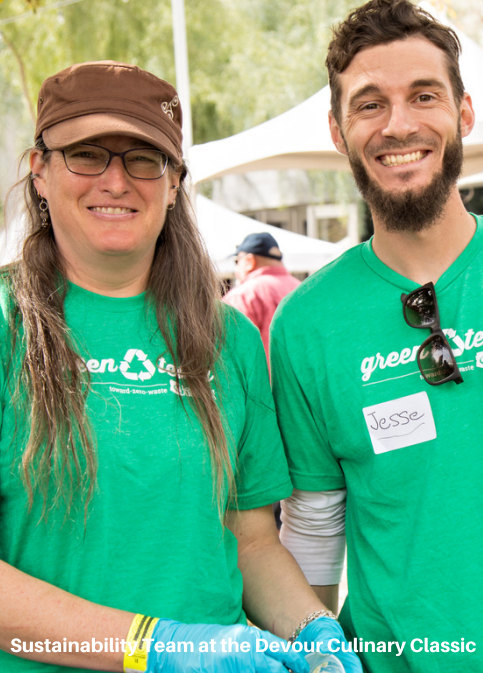
Sustainability Team at the Devour Culinary Classic