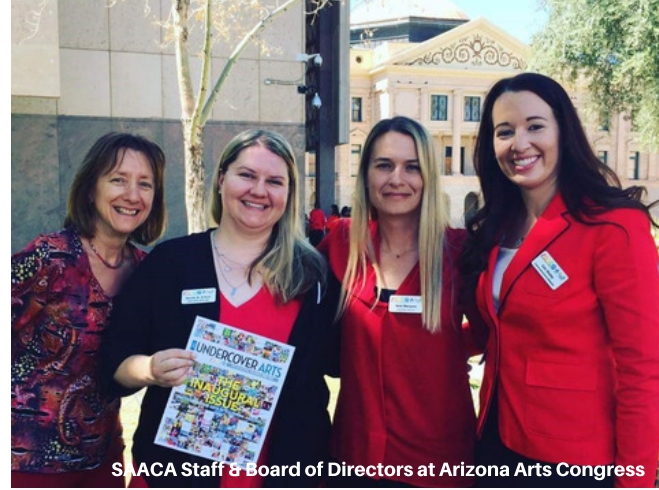
SAACA Staff & Board of Directors at Arizona Arts Congress

This year, SAACA surpassed an annual operating budget of over one million dollars for the 2017-2018 Fiscal Year, reflecting a milestone for community arts investment.