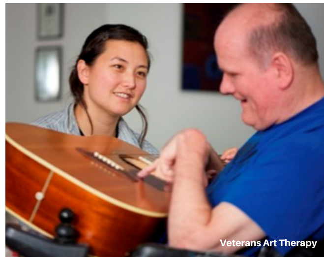
Veterans Art Therapy